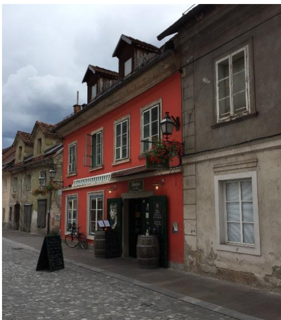
Entrance into Špajza Restaurant (the red building)

Restaurant Špajza is approximately 2 km away from Hotel Lev. Those who are willing to take an evening walk to the restaurant can join a guided walk through the Ljubljana Downtown. We meet at 17:30, after the last Friday conference session, in front of Hotel Lev.